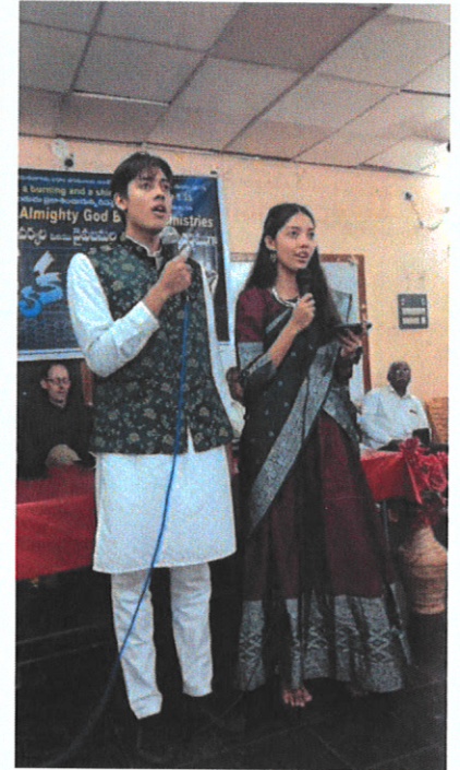
Our Children Singing