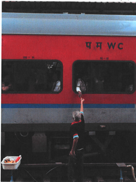
Indians Need the Bread of Life